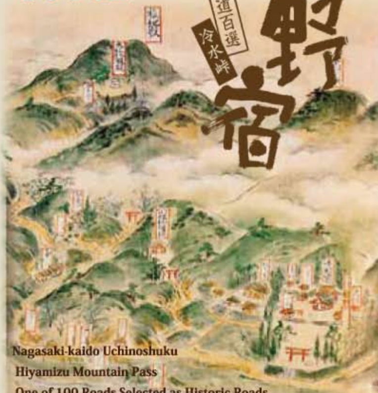
Nagasaki-kaido Uchinoshuku Hiyamizu Mountain Pass One of 100 Roads Selected as Historic Roads