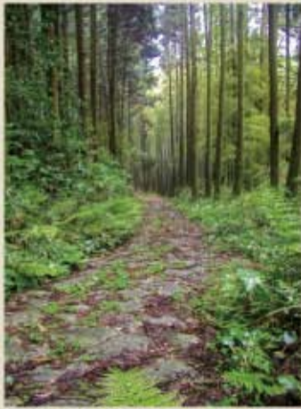
Hiyamizu Mountain Pass Stone Paved Pass

Now you can still find 'isidatami(stone paved pass) along Hiyamizu Mountain Pass on which travelers walk up from Uchino.