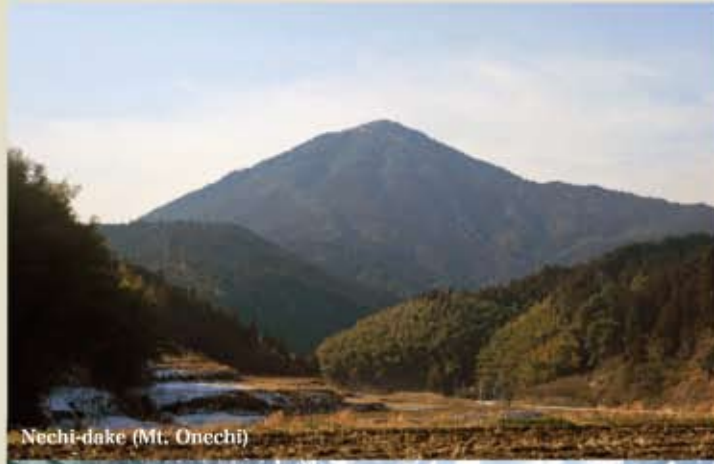
Neechi-dake (Mt. Onechi)