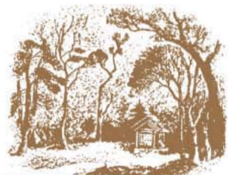
Kubinashi Jizo of Hiyamizu Pass

(god of fox) at Onechi Shrine. This 1000-year-old fox with a magical power lived near Mt. Fuji. But in 1192 he escaped from the hunting done by Yoritomo Minamoto and came to Mt. Onechi.