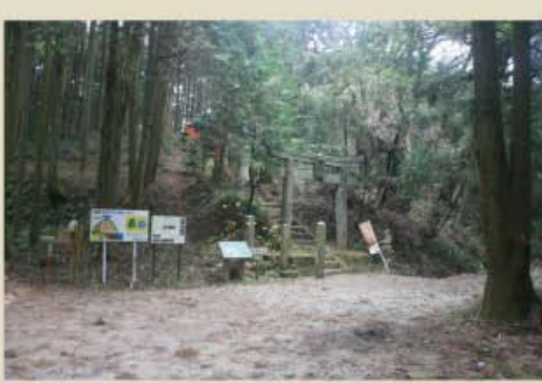
Nagasaki Kaido Road Hiyamizu Mountain Pass (Onechi Shrine The start of trail for praying)